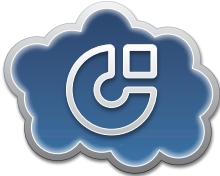
Cast Iron Cloud™

The Cast Iron Cloud for Oracle CRM On Demand is our integration-as-a-service solution. Using a "develop once, deploy anywhere" approach, the Cast Iron Cloud is ideally suited for Oracle CRM On Demand customers with a majority of their applications based in the Cloud and want no infrastructure on-premise.